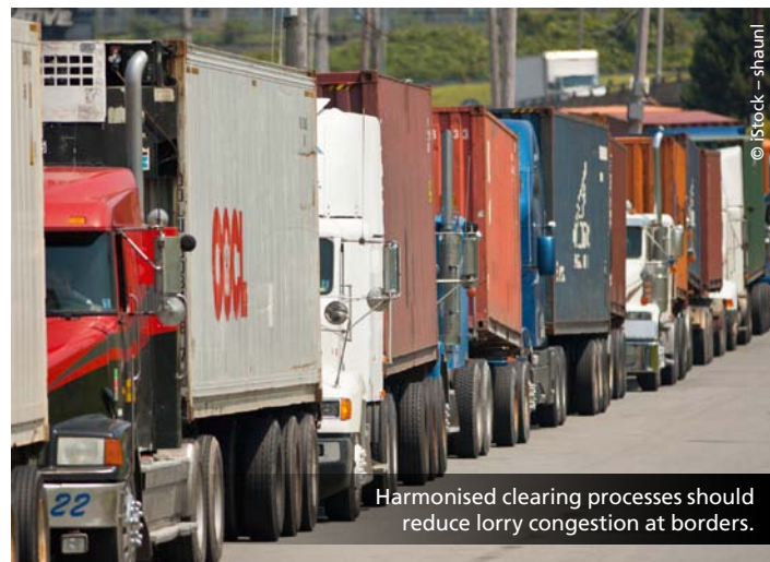
Harmonised clearing processes should reduce lorry congestion at borders.

Further details can be found at www.ambercoastlogistics.eu .