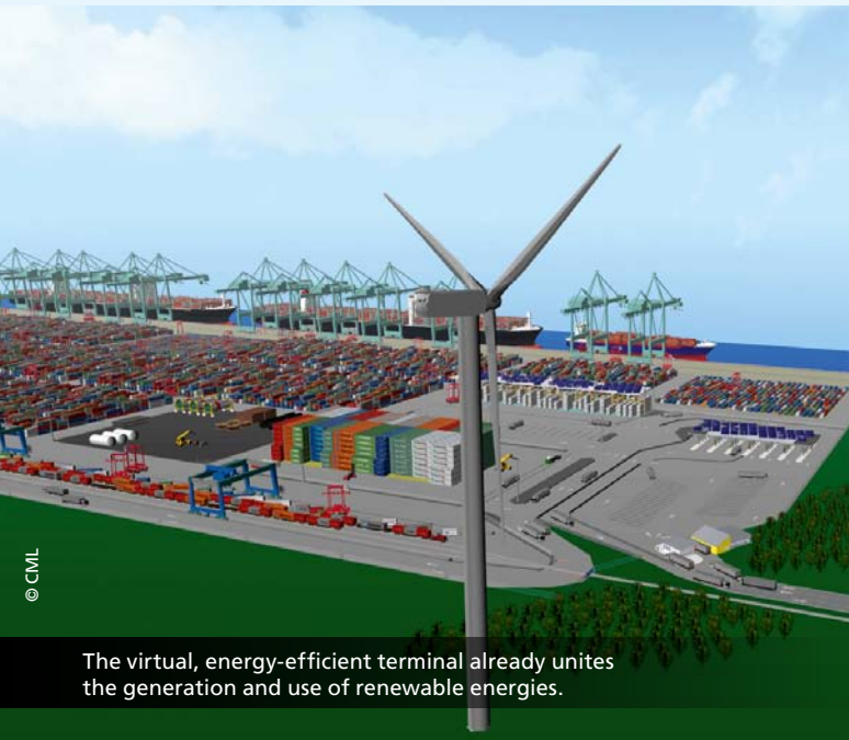
The virtual, energy-efficient terminal already unites the generation and use of renewable energies.

With the help of the planning and simulation tools at the Fraunhofer CML, it is now possible to visualise the energy consumption of terminals. Information is collected for every element of the terminal – be it a crane, vehicle or building – with the help of a database, which displays specific consumptions, emission values and capacities. In this way, it is possible to display the energy efficiency of the terminal and assess current and future processes. In addition, the possibilities for supplying energy using renewable energies such as solar energy, wind energy and biomass energy are evaluated. The basis for this is the energy management, which monitors the energy supply and energy consumption. „Our visualisation model, complemented with analyses and research, will be a very helpful tool in the course of the increasing efficiency and sustainability requirements on terminals“, said Dr. Svenja Töter of the Fraunhofer CML.