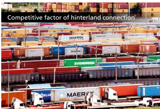
Competitive factor of hinterland connection